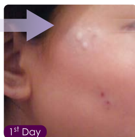
The dressing of exp-group absorbs excessive fluid. Change the dressing, when it turns into white.