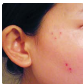
post-op Five spot wounds left after laser treatment.