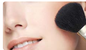
under make up