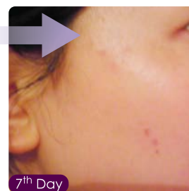
In comparison, the wounds of exp-group are perfectly healed with less pigmentation.